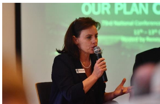
Our Plan – Our Future 2017 National Conference & AGM in Renmark.

In that time, we have seen the Basin community travel the often-painful course from storm to norm, and now well into the deep reforms of the Murray-Darling Basin Plan. We have seen communities react to changing water availability and recognise that drought, climate change, agricultural practices, floods, technologies all contribute to the challenging but necessary balance of equitable water sharing, not just in the Basin but across Australia. We have also seen local government and the MDA lead the way in building consensus by sharing knowledge to understand the experience of communities beyond their own.