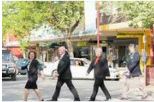
With apologies to Abbey Road, after my first, our 70th National Conference at Tumut, 2014.

I am beyond grateful for my time at the MDA. I leave the job knowing our collective efforts have made a difference and that momentum is gathering! Local leadership - it's a national priority.