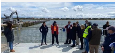
Participants learning about the barrage system at Goolwa