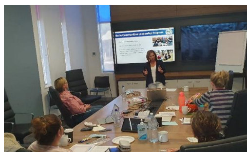
Basin Communities Leadership Program in Cunnamulla, 2021.